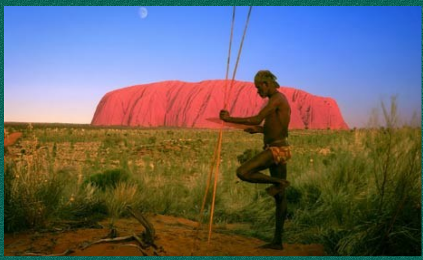
Uluru (Ayres Rock) - Northern Territory Australia

On this trip I: crossed four states and two territories; travelled to five of Australia's biggest cities; saw the federal Government; went to the Melbourne Cricket Ground (MCG); drove the Great Ocean Road; went shopping In Adelaide; looked out over the Red Centre in Alice Springs and walked round the base of Ayres Rock.