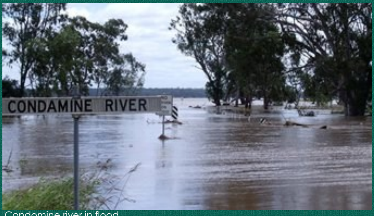
Condomine river in flood

I was stuck for about two days unable to get anywhere but this was nothing compared to the people of nearby Toowoomba and the Lochyer Valley who lost their businesses and tragically 17 people lost their lives. This tragic event affected me and made everyone involved realise just how much they have and appreciate life a little more.